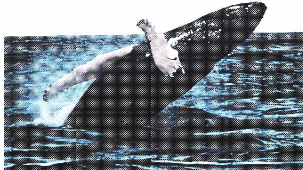
A common behavior of a humpback whale is breaching.