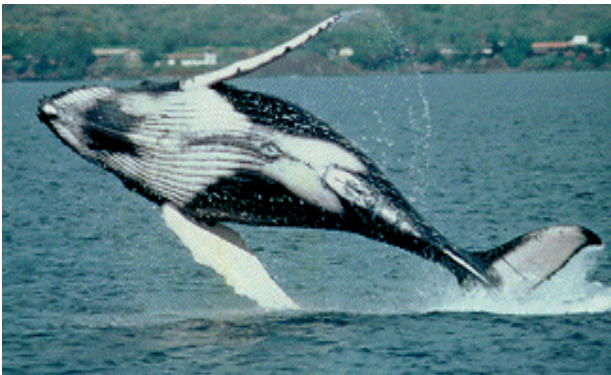
Humpback whales can rise high out of the water when breaching.

http://birds.cornell.edu/BRP/SoundsHBWhale.html