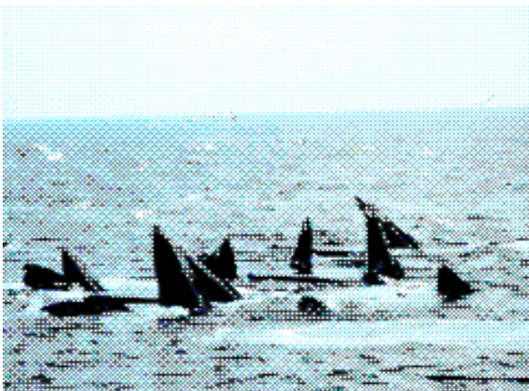
Humpback whales can form groups to feed.

Humpback whales can be found in all the world's oceans. They mostly live in coastal and continental shelf waters, though they sometimes feed around seamounts and migrate through deep water. Every year, they follow a regular migration route from warm waters to cold waters and back. Some humpback whales make a round trip journey of 10,000 miles!